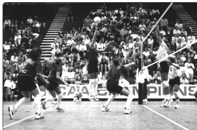
The Central Missouri Jennies hosted the 1996 NCAA Division II Elite Eight, placing fourth.

Note: The MIAA determined conference champions through regular season records from 1993-2005. From 1983-92 and from 2006-present, a postseason tournament determined the champion.